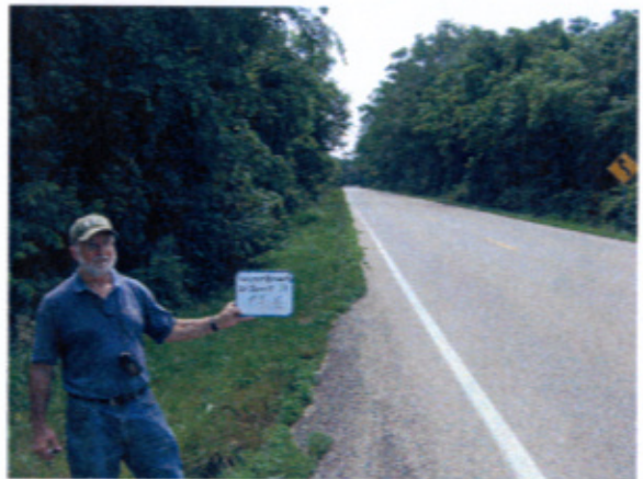
Photo Pt. 5, looking E at SW corner along S edge & Rt. 126