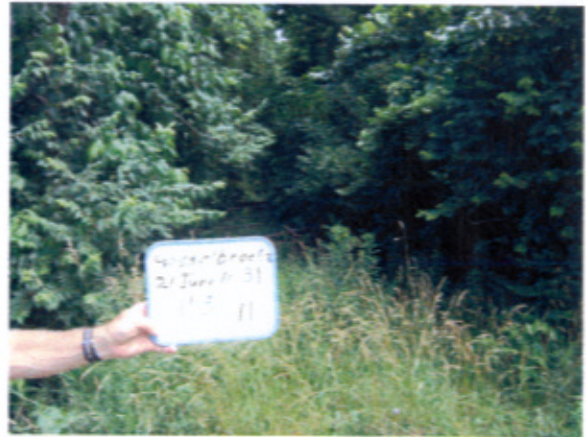
Photo Pt. 5, looking N at SW corner on St. Rt. 126 along W edge