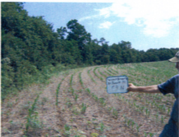
Photo Pt. 4, looking N at SE corner on St. Rt. 126 along E edge