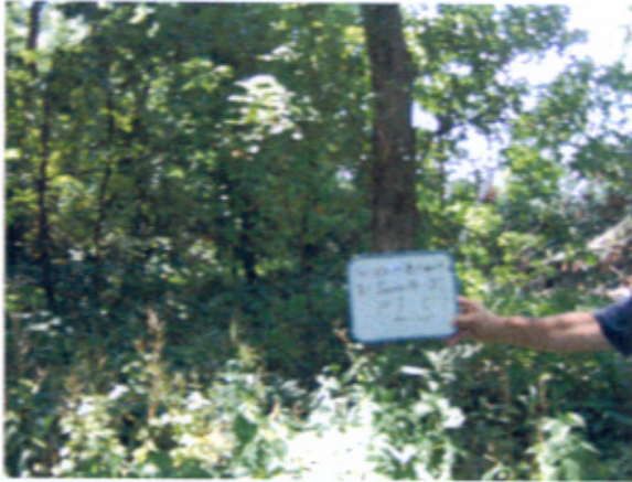
Photo Pt. 1, looking S at NW corner along W edge