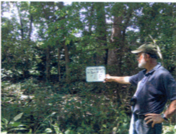
Photo Pt. 1, looking E at NW corner along N edge